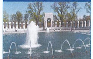
World War II Memorial