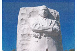
Martin Luther King, Jr. National Memorial