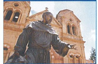
St Francis Cathedral in Santa Fe

Day 11: Today After enjoying a Continental Breakfast, you will depart for home... a perfect time to chat with your friends about all the fun things you've done, the great sights you've seen, and where your next group trip will take you!