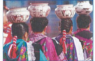
Native Southwestern Culture and Crafts