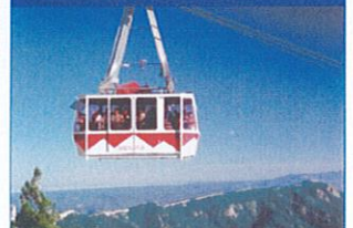
Breathtaking Views of the Sandia Mountains