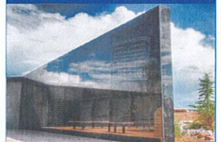
New Mexico Veterans' Memorial