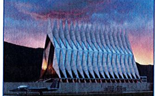
Visit to the U.S. Air Force Academy

Day 9: Today after enjoying a Continental Breakfast, you depart for home... a perfect time to chat with your friends about all the fun things you've done, the great sights you've seen, and where your next group trip will take you!