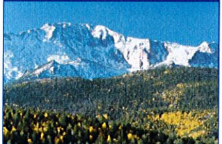
Famous Pikes Peak - America's Mountain