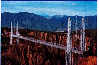
Visit to the Royal Gorge Bridge and Park