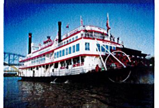
Enjoy a BB Riverboats Sightseeing Cruise