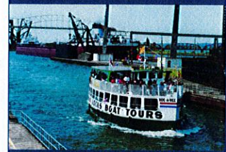
Soo Locks Cruise in Sault Sainte Marie