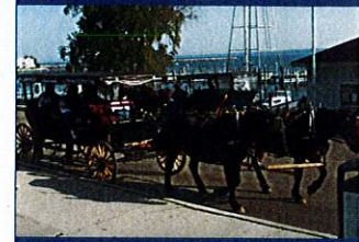
Tour Mackinac Island by Horse and Carriage

Diamond Tours inc. Bringing Group Travel to a Higher Standard®